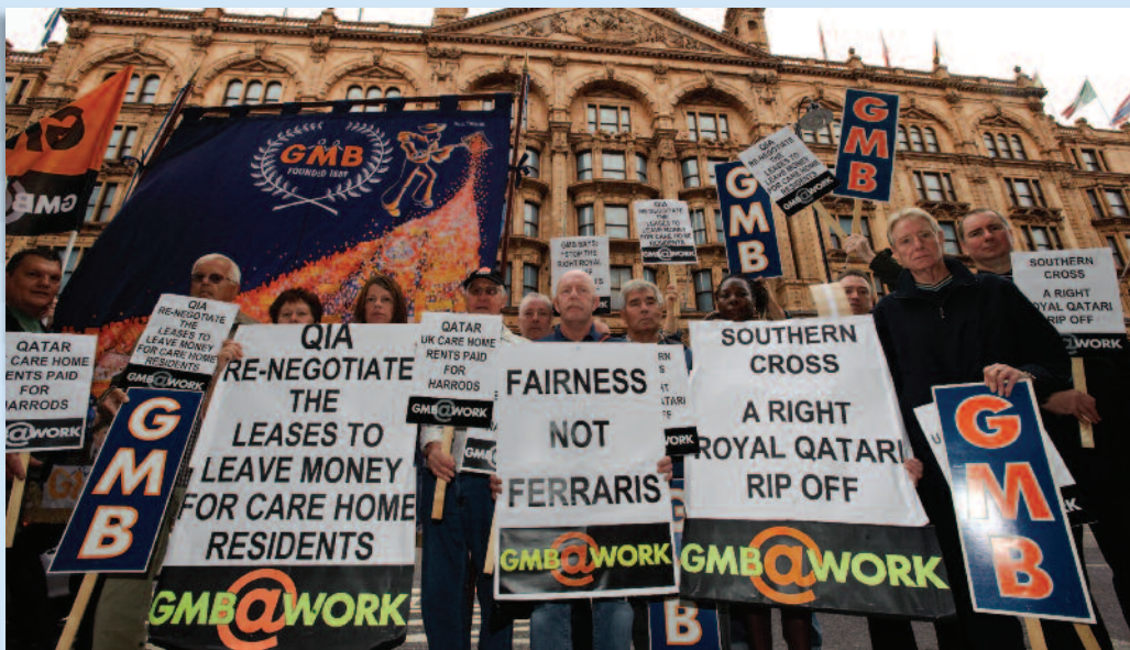
GMB demonstration August 2010 at Harrods over Qatari Investment Authority overcharging rents on freeholds of Southern Cross care homes

The Emir of Qatar is due to meet the Queen on a state visit to Britain on 26th October 2010 and will be with the Queen at Windsor. GMB is planning a reception committee. The slogan will be 'Emir, Open Your Eyes to Rip-offs in Your Care Homes' .