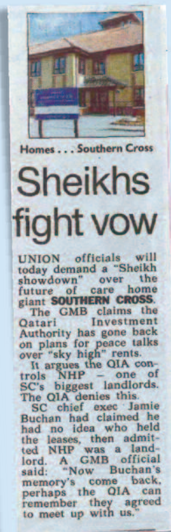
The Sun Friday 24th, September 2010