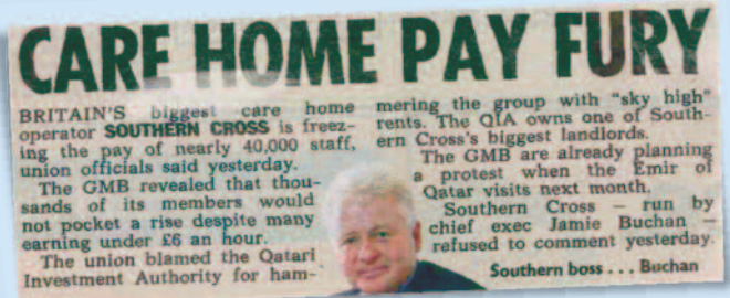
The Sun Tuesday 28th September 2010